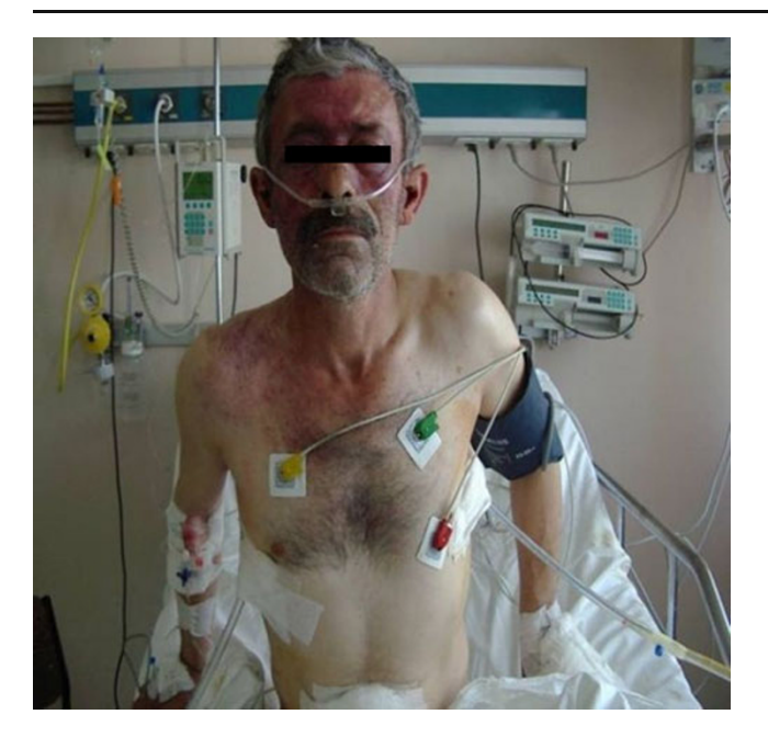
Fig. 1 Figure showing a patient with traumatic asphyxia. The head, neck, and upper chest were strikingly cyanotic and edematous, with multiple petechiae; he also had bilateral subconjunctival hemorrhages and bilateral hemopneumothorax

thoraces in one patient. Their head, neck, and upper chest were strikingly cyanotic and edematous, with multiple petechiae; they also had bilateral subconjunctival hemorrhages (Figs. 1, 2). The treatment included bilateral chest tube thoracostomy in one patient and measurement of arterial blood gases, oxygen, and fluid supplementation as conservative management in all patients. None of the patients needed mechanical ventilation. The hospital stay ranged from 4 to 7 days (mean 5.6 days). There was no mortality, and hospital courses were uneventful.