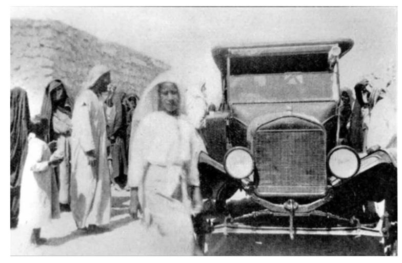
Fig. 2 "The Little Traveler" is the model T Ford used by the mission in the early twentieth century

On 15 June 2019, the unified vision was achieved, and the official launch of the National Ambulance under the Ministry of Interior (MOI) was announced, which includes the main NA control center and 13 dispatch stations [16]. The EMS time event history in the Kingdom is summarized in Table 1.